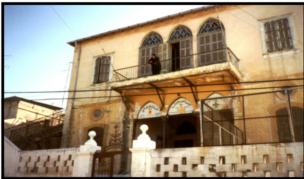
The Greek Orthodox Club in Jaffa, Israel where the Hinn family lived in the basement level.

rooms on the ground floor of a building owned by the Greek Orthodox Church. 29 This is a far cry from his previous description that, "We lived comfortably. Dad's position in government made it possible for us to have a home in the suburbs. It was a wonderful home." 30 Strangely though, Hinn qualifies his admission by interjecting, "there was ample room." 31 Once again, we are confronted with Hinn's ongoing childhood delusions since the reality of nine people living in three rooms would hardly be "ample room." One can only imagine the conditions with seven children living in one bedroom.