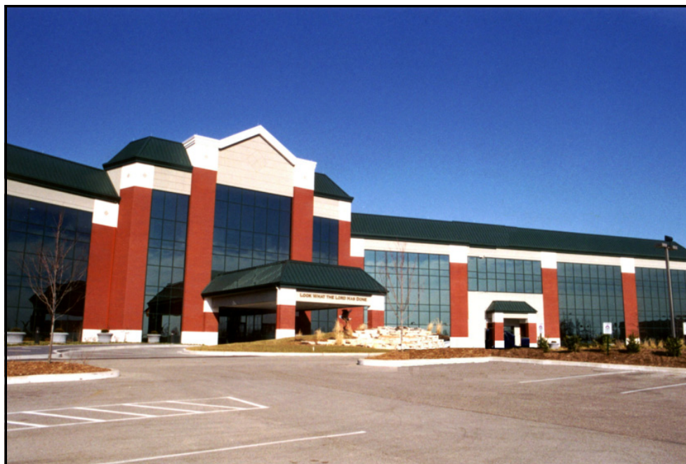
Joyce Meyer Ministries’ new $20-million facility west of St. Louis where, according to a local television station, Meyer is said to be “large and in charge.”

There is a danger in following people like Meyer. She holds out just enough truth to throw one off track. The claims of God-given teaching also intimidate one who would question. Of the small bits of truth she teaches, Christians will have no problem. It is the additions that cause trouble. Jesus warned about the doctrines and commandments of men (Matthew 15:9). Meyer’s appetizers — such as marriage enrichment, weight control, and health improvement — may sound