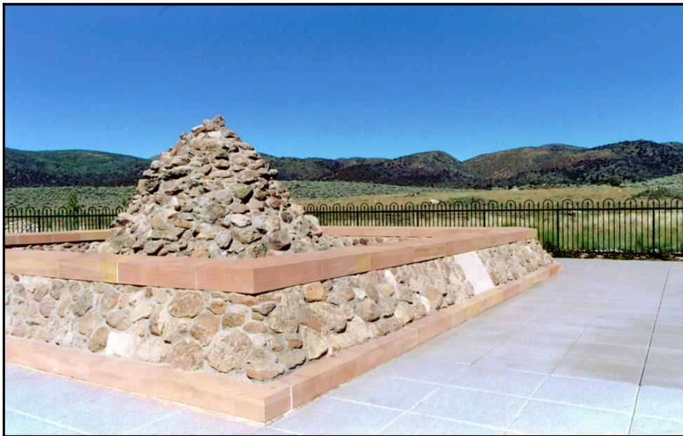
The Original 911 — The Mountain Meadows Massacre Grave Site Memorial in Southern Utah. It was here, on September 11, 1857, that at least 120 unarmed men, women, and children were murdered in cold blood by Mormons and local Indians.